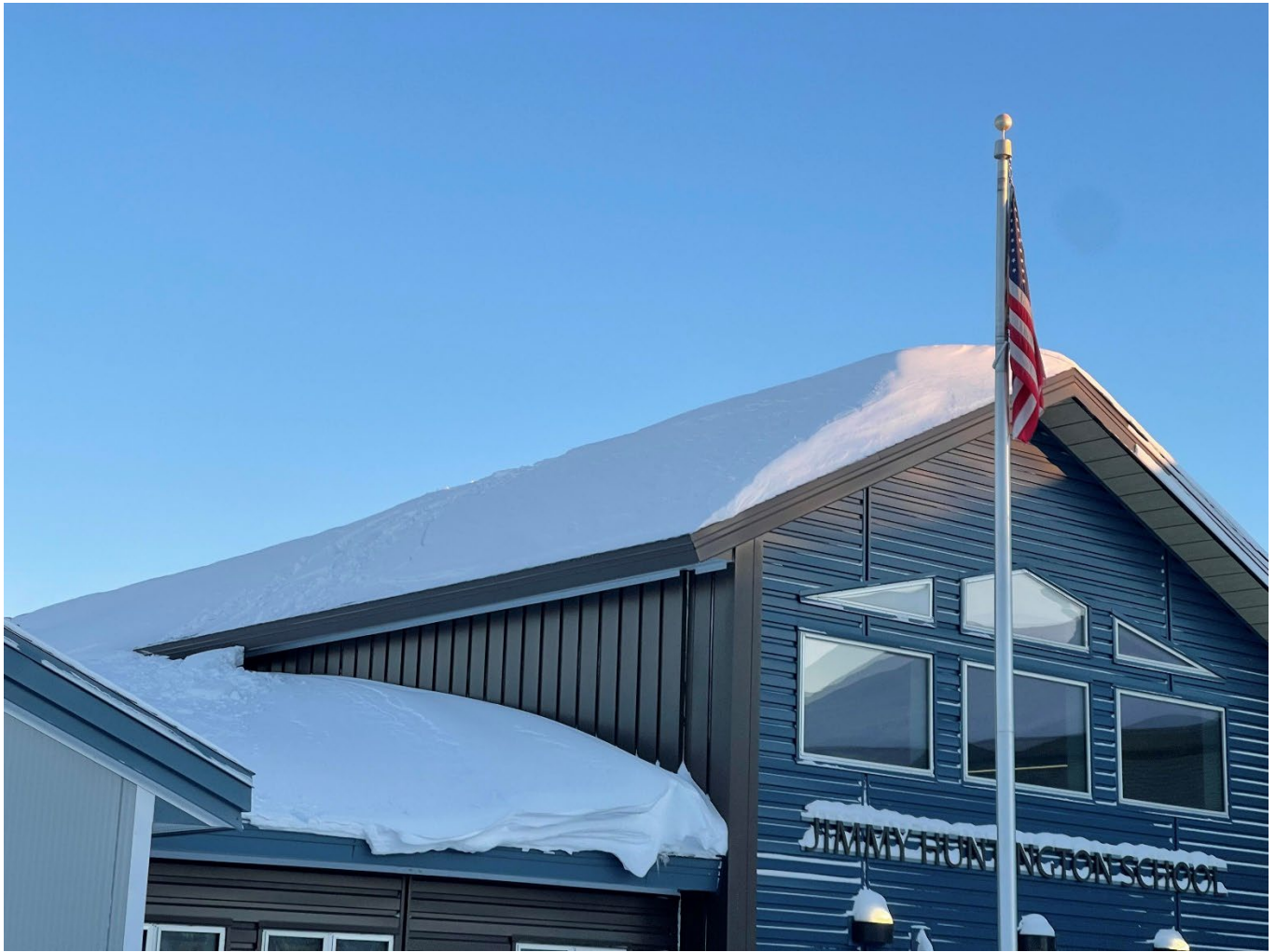
Jimmy Huntington School, Huslia AK Yukon Koyukuk School District